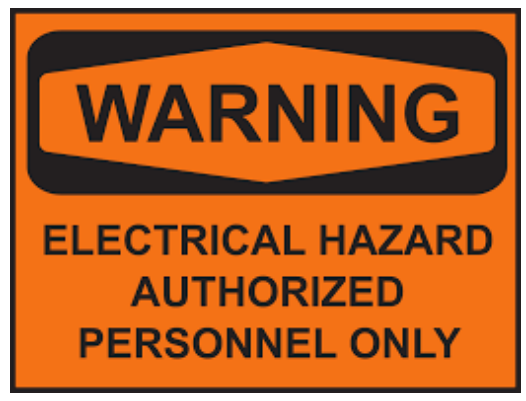
Figure 1 Warning Label - Electrical Hazard

be kept locked. Danger and restricted entry notices shall be provided on the door to warn against unauthorized entry.