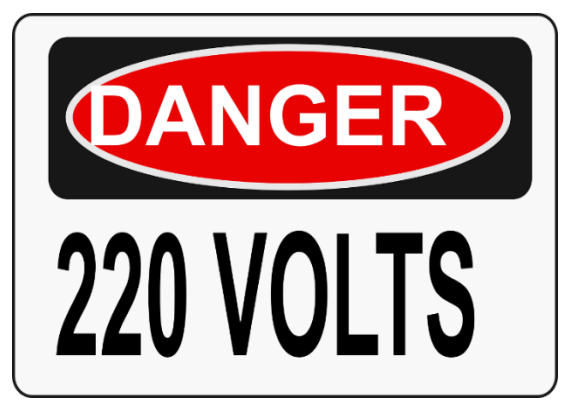
Figure 2 Danger Label - Electrical Hazard